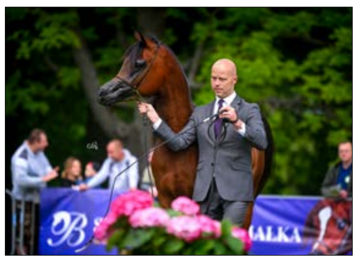
Best in show MALE