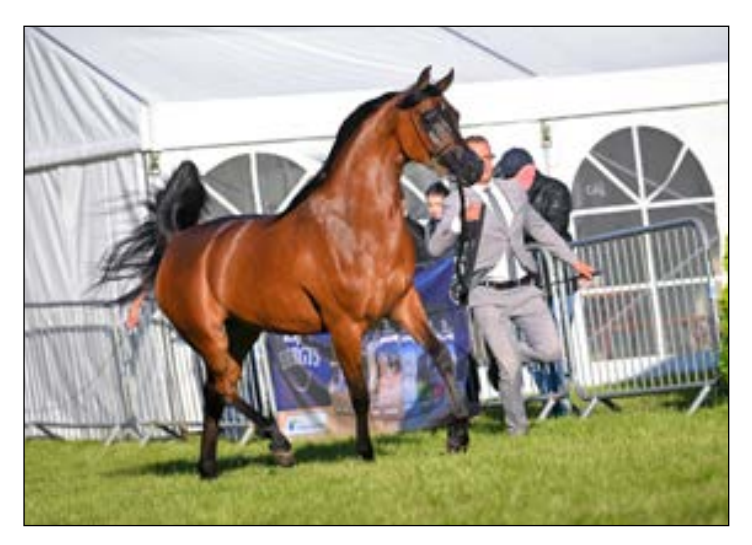
Highest scoring Junior Filly of Polish Associated Owner Best Mover Best Legs