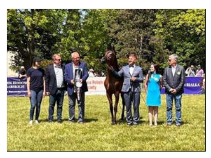
Highest scoring Yearling Filly of Polish Associated Owner