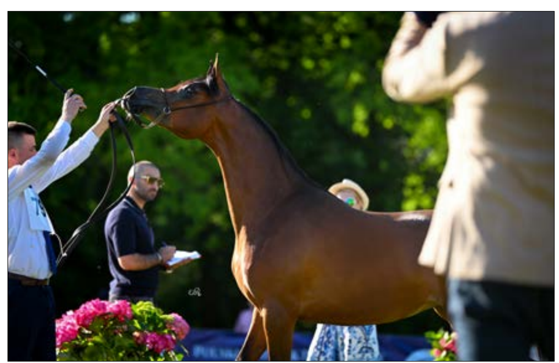
Top Five Junior Fillies | LABONITA DOMINIC M X LAKONIA | B/O: STADNINA KONI MICHALOW