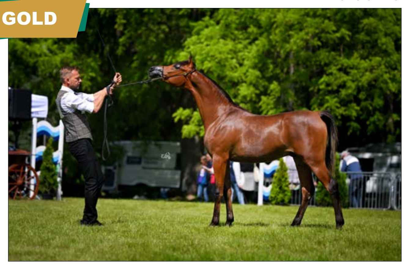
Gold Medal Yearling Colts | PRAVO KL

PROMETEUSZ X PORTA KL | B: STADINA KONI KLIKOWA | O: KLIKOWA SPOLKA JAWNA