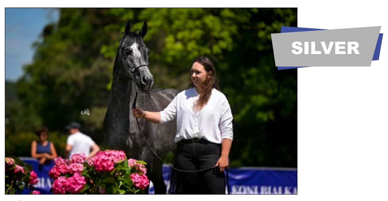
Silver Medal Junior Mares | ELANDA

ALERT X CERIKA | B/O: STADNINA KONI BIALKA, MHR SP. Z 0.0