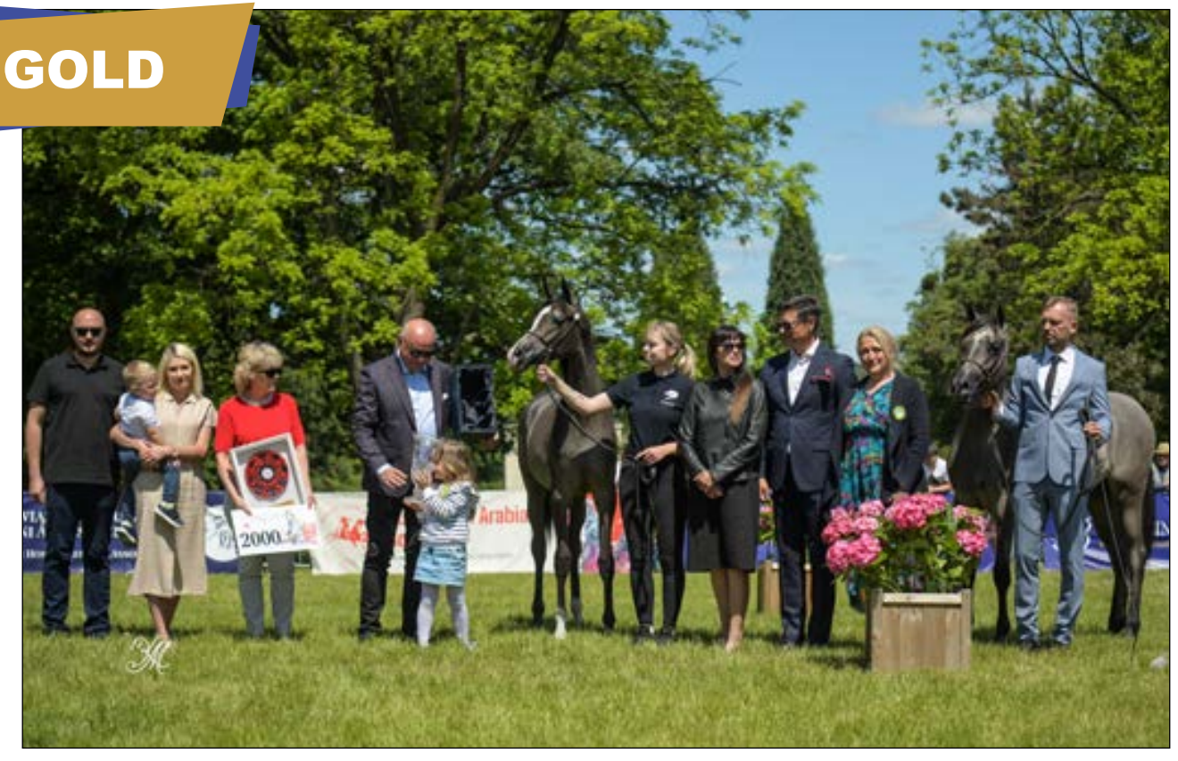
Gold Medal Junior Fillies | PIANINA KL

EL JAHEZ WH X AJ PENELOPE | B: SK KLIKOWA | B: KLIKOWA SPOLKA JAWNA