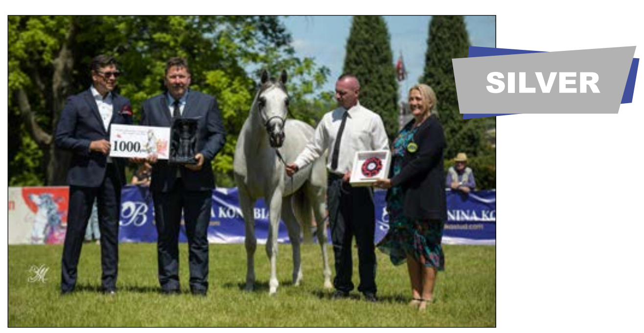
Silver Medal Junior Stallions | MOHORT PALATINO X MALOWANA LALA | B/O: AGRICOLA MAZURY

GANGES X EGIZA | B: SK BIALKA | O: MHR SP. Z O.O