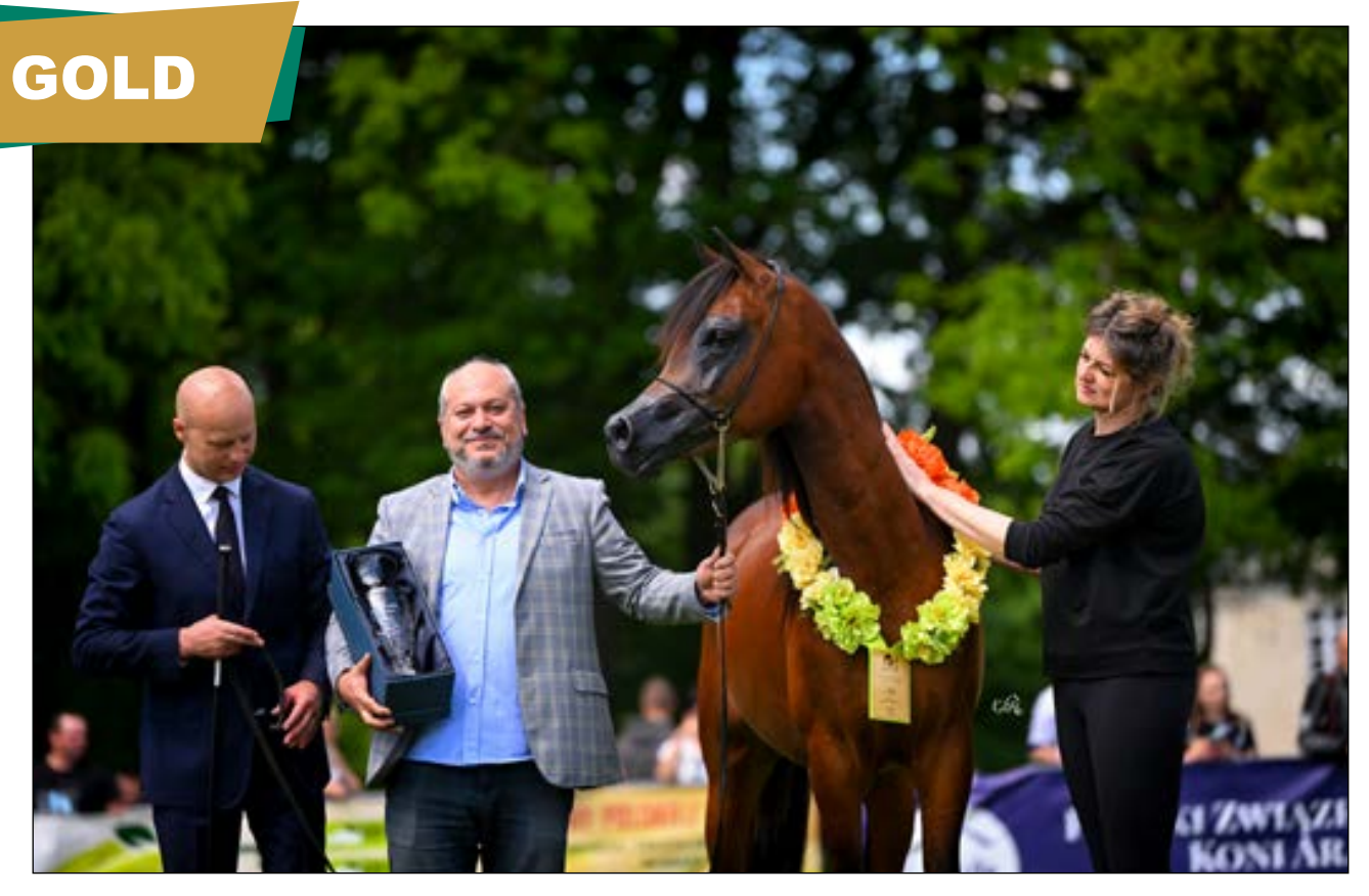
Gold Medal Junior Colts | NISSER BABEL