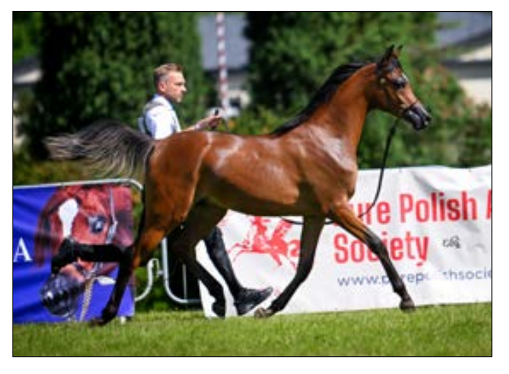
Highest scoring Yearling Colt of Polish Associated Owner