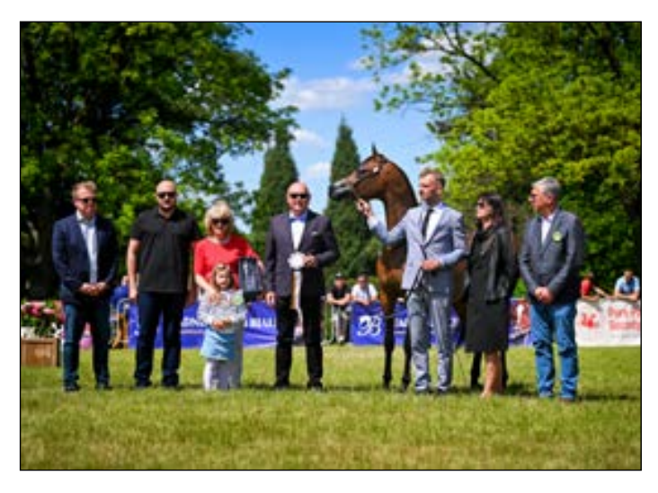
Highest scoring Junior Colt of Polish Associated Owner