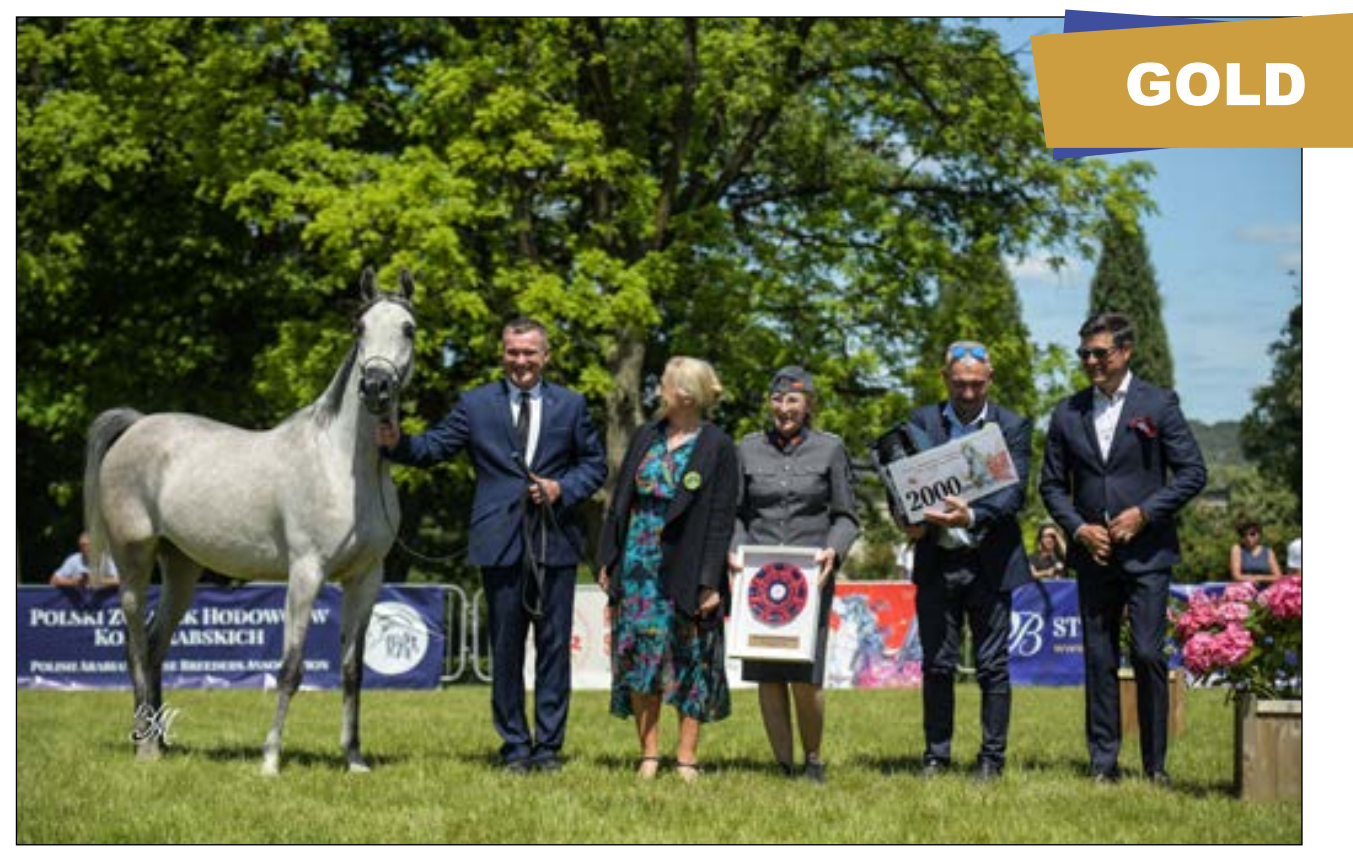
Gold Medal Junior Mares | CHILIA

ALERT X CERIKA | B/O: STADNINA KONI BIALKA, MHR SP. Z 0.0