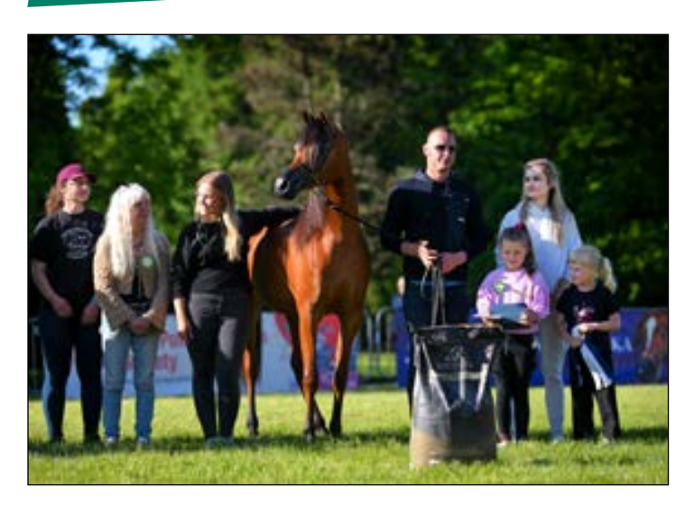
Best in show FEMALE Best Head