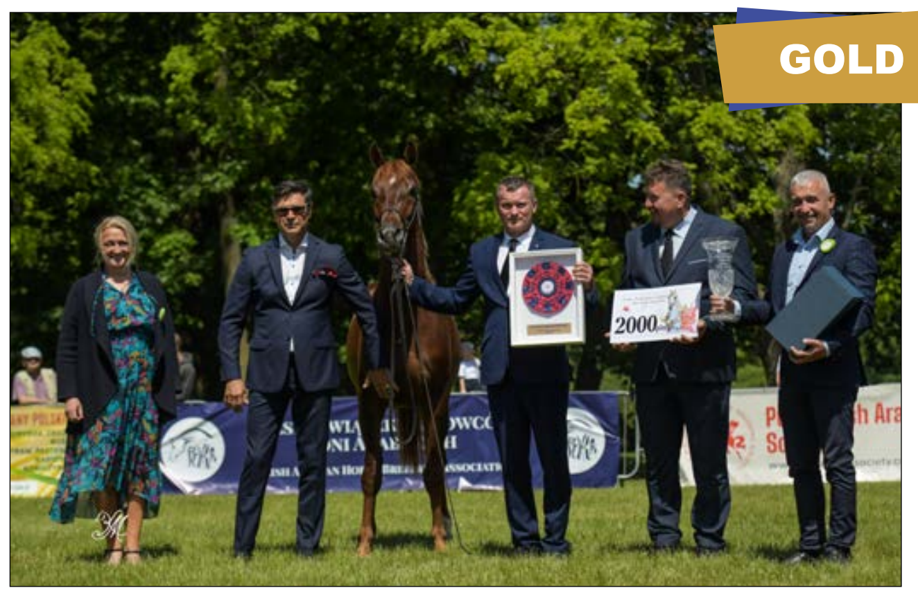
Gold Medal Junior Stallions | EGIZON

GANGES X EGIZA | B: SK BIALKA | O: MHR SP. Z O.O